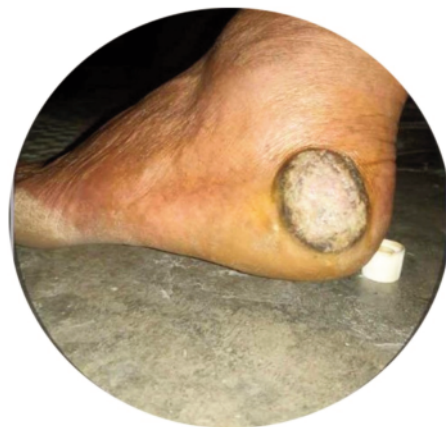
Figure 1. A large ulcerative dark, brown-colored plaque skin lesion with pigmentation at the periphery on the lateral side of the left heel (ALM lesion).

Upon physical examination, the patient looked clinically well and healthy. However, there were multiple bilateral white depigmented/hypopigmented vitiliginous patches on the scalp, face, dorsum of the hands, arms, lower abdomen, and feet, particularly on the left heel surrounding the site of the previously operated ALM (Figure 2). Vitiligo was a clinical diagnosis established in this patient through a comprehensive medical history. The assess-