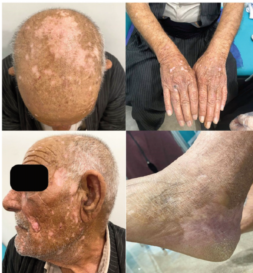
Figure 2. White depigmented/hypopigmented vitiliginous patches on the scalp, face, dorsum of the hands and arms, and lateral side of the left heel surrounding the site of the previously operated ALM.

The patient did not receive immunotherapy after the surgical resection of the ALM due to poor socioeconomic status, which led to difficulty in affording the treatment or the associated costs, such as travel, accommodations, and supportive care, in addition to the lower health literacy. He was untraceable for follow-up until he consulted the dermatologist 12 months later, presenting with vitiligo vulgaris. No treatment was advised for the patient's vitiligo vulgaris; only observation was recommended. However, due to the patient's history of ALM and the pathological stage of the melanoma, he was referred to an oncologist at Hiwa Hospital. They