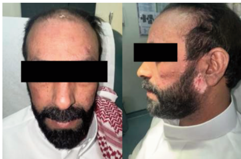
Figure 3. Clinical appearance after clindamycin treatment.