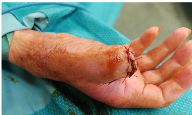
Figure 2. Clinical presentation after distal phalangeal amputation.

erative course was complicated by stump infection and wound dehiscence, necessitating further surgical intervention and prolonged antibiotic therapy. The patient had comorbidities, including osteoporosis with vertebral fractures, depressive syndrome, and severe functional decline (Karnofsky score 50; Eastern Cooperative Oncology Group [ECOG] 3), which precluded the use of immunotherapy due to her fragile condition and a body weight of only 39 kg. Currently, the patient is alive, disease-free, and under regular follow-up.