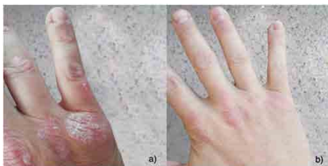
Figure 3. Images showing the dorsum of the right hand at day 0 (a) and day 8 (b) reveal a clear reduction in lesion size and inflammation, with marked improvement in skin texture. At day 0, erythema and scaling are evident, while by day 8, there is a significant decrease in redness and scaling.

day treatment, participants exhibited a notable decrease in lesion extent by approximately 40% and an impressive improvement in inflammation, approximately 50%. The resolution of desquamation and infiltration in a significant proportion of participants further attests to the formulation's efficacy. Notably, the 60-day follow-up indicated that these clinical gains not only persisted but also occurred without any delayed adverse effects, suggesting a robust safety profile for the treatment. These findings align with existing literature that describes the anti-inflammatory capabilities of oleocanthal, particularly its inhibition of COX enzymes, alongside the antioxidant and anti-inflammatory activities attributed to oleuropein aglycone and hydroxytyrosol. 13-15 However, further studies are needed to confirm direct penetration and biological activity within psoriatic lesions. The therapeutic impact of these compounds through topical application is noteworthy, as studies have demonstrated that phenolic compounds can modulate important cytokine expressions such as tumor necrosis factor (TNF)- \alpha , IL-1 \beta , and IL-6, as well as influence transcription factors like nuclear factor kappa-light-chain-enhancer of activated B cells