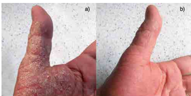
Figure 4. Images of the palm of the left hand, specifically the thenar eminence, demonstrate the effects of the treatment on days 0 and 8. On day 0 (a), the lesion is prominent, with moderate inflammation and desquamation. By day 8 (b), the lesion has almost completely resolved, with a noticeable reduction in both inflammation and scaling.