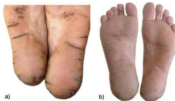
Figure 5. Images of the soles of the feet, taken at day 0 (a) and day 8 (b), show a reduction in the extent of lesions. On day 0, severe desquamation and moderate inflammation are observed. By day 8, both desquamation and inflammation are substantially reduced, and the skin appears smoother and more hydrated.