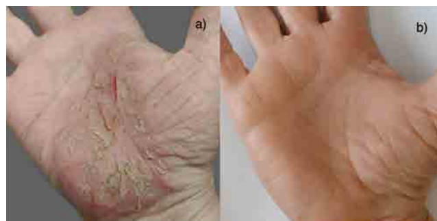
Figure 6. Palm images at day 0 (a) and day 60 (b) document a complete reduction in flaking and cracking, along with improved skin texture and hydration. On day 0, peeling and cracking are clearly visible in the central region of the palm. At day 60, the lesions have disappeared, and the skin surface appears smooth, reflecting a notable improvement in the severity of palmoplantar lesions during this interval.